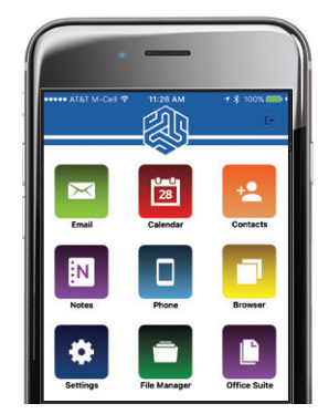
Sign up today: Secure.Systems