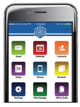
Sign up today: Secure. Systems